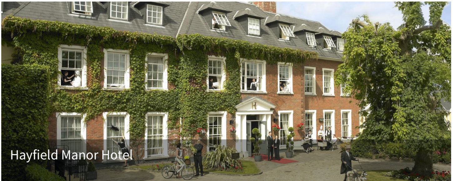
Hayfield Manor Hotel