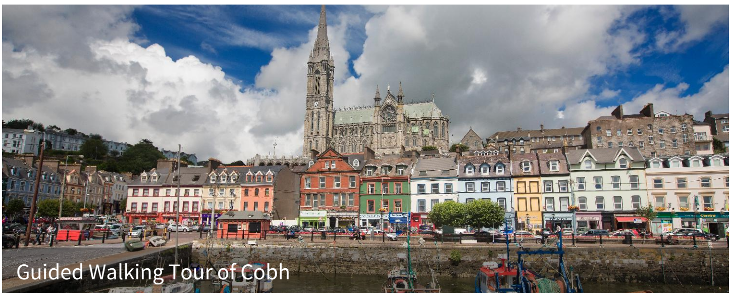
Guided Walking Tour of Cobh