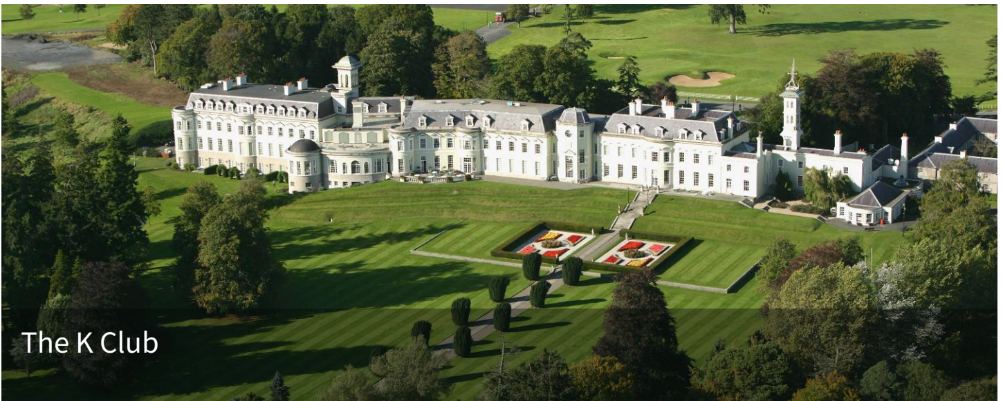
The K Club

Upon your arrival by private plane into Dublin Airport, you will be met by your private driver to transfer you to The K Club.